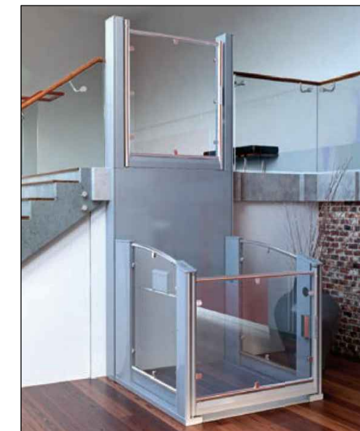
TYPICAL IMAGE OF PLATFORM LIFT