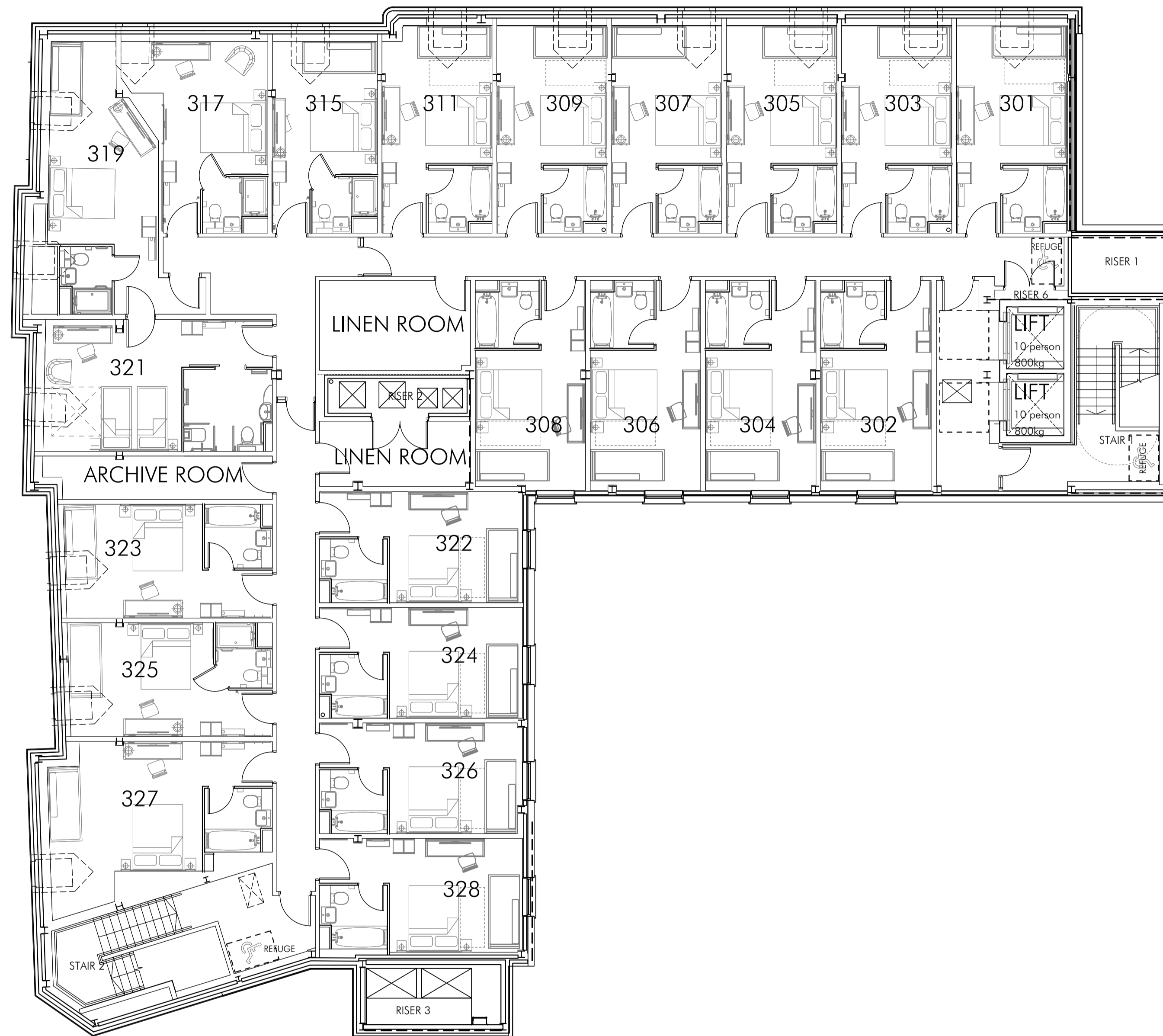
PROPOSED THIRD FLOOR PLAN