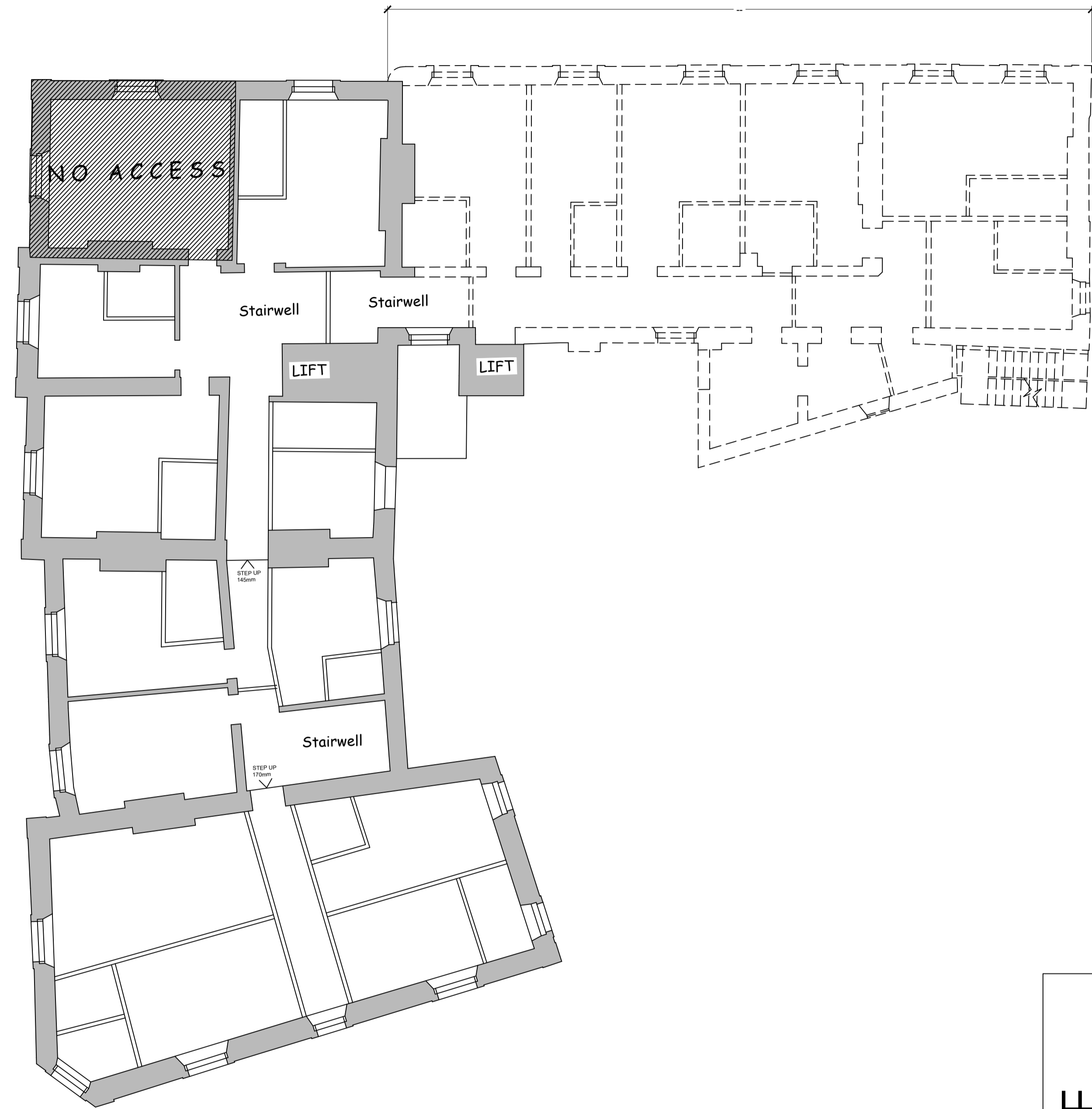
EXISTING FIRST FLOOR LAYOUT

0 1m 2m 3m 4m 5m 10m SCALE 1:100 IN METERS