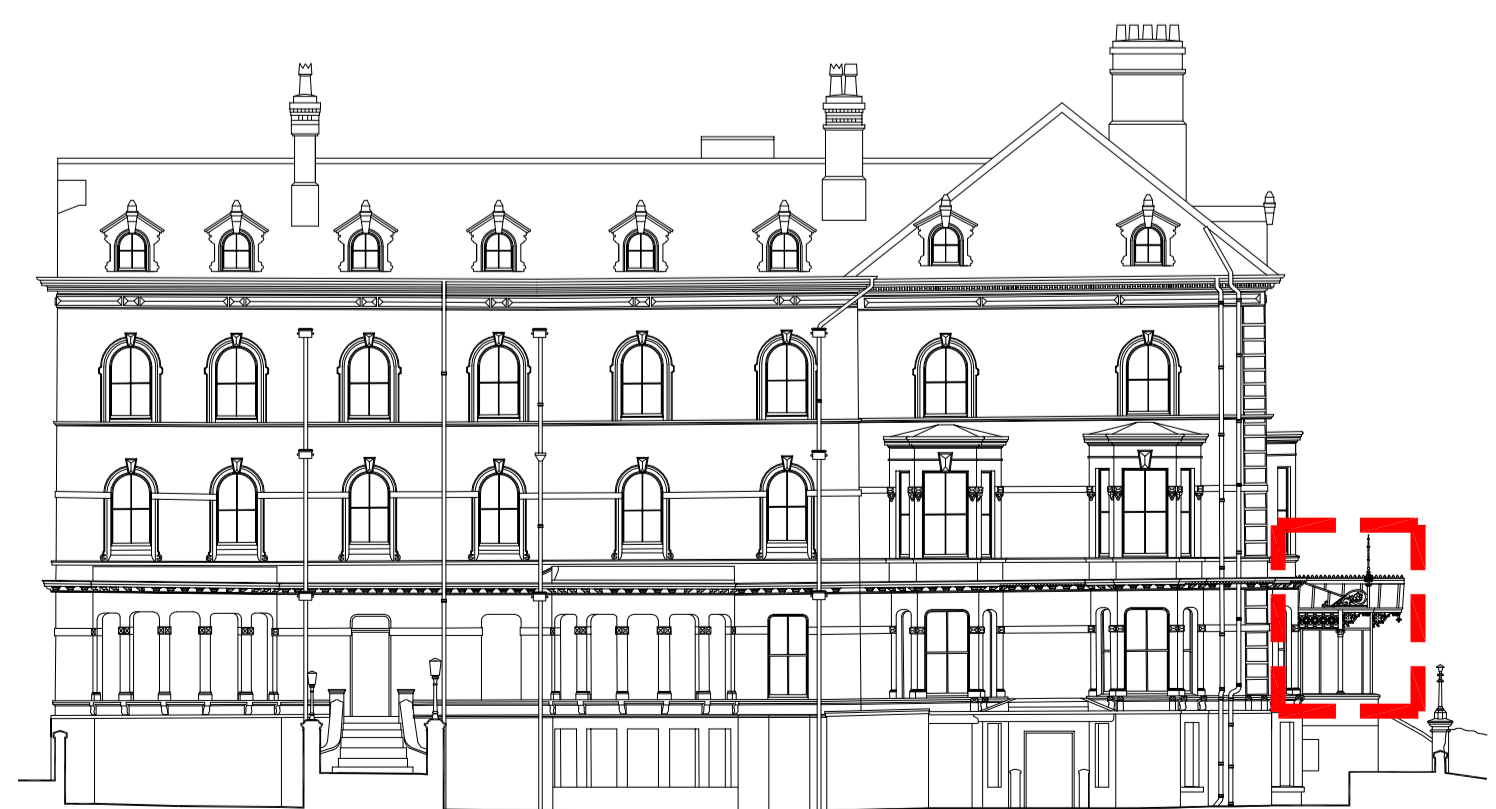
EXISTING SIDE ELEVATION - MOSTYN BROADWAY ELEVATION